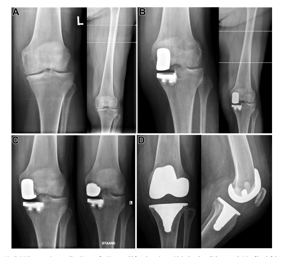
Fig. 3. Radiographs of revision No. 7. (A) Preoperative standing X-rays of a 60-year-old female patient with isolated medial osteoarthritis of her left knee. Her BMI was of 29.3 kg/m<sup>2</sup> before surgery. No particular medical history. The standing X-ray showed a medial grade 4 osteoarthritis. The patient's limb alignment was 6° varus. (B) Postoperative standing X-rays at 1 year showed a well-fixed femoral and tibial component, no overhang, discrete medial position of femoral component, 2° valgus cut on the tibia. An 11-mm polyethylene insert was used. Postoperative limb alignment of 1° varus. Joint line was raised by 2 mm. Patient was developing lateral pain due to overcorrection and lateral overload. (C) Postoperative standing X-rays at 4 year (anteroposterior + Rosenberg view) showed minor degenerative changes in the lateral compartment without lateral joint space narrowing. Patient continued having lateral pain. (D) Postrevision X-rays at 4.5 year: incapacitating lateral pain resulting in revision to TKA at 4.2 years postoperative. TKA, total knee arthroplasty.

One revision in our series occurred due to severe synovitis, longstanding since before the index operation. Although the cause of the synovitis was never elucidated, extra attention should be